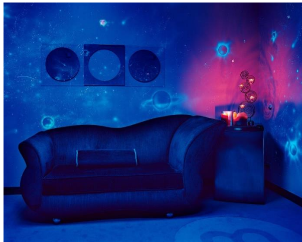
After the deaths of these 10 notable people, The New York Times photographed their private spaces — as they left them.