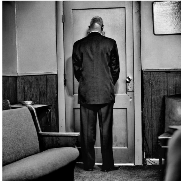
Photographer Matt Black travels throughout the US documenting high poverty areas.