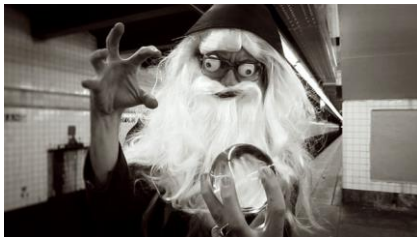
creating wiggle GIFs from video