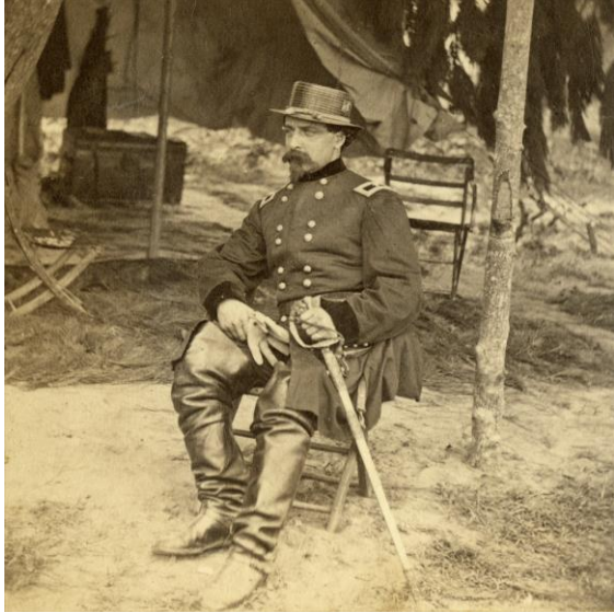
3D pictures became popular in the 1850s!