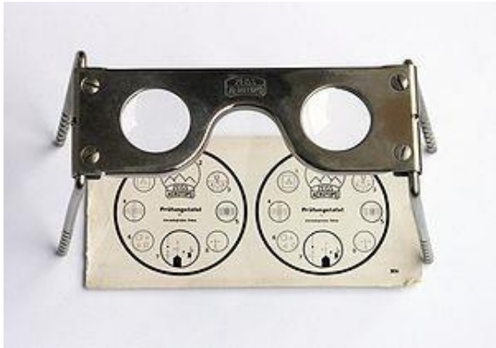
a little bit more history